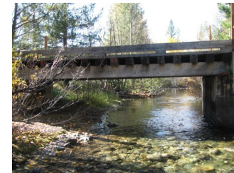
(Left) Chikamin Bridge #807