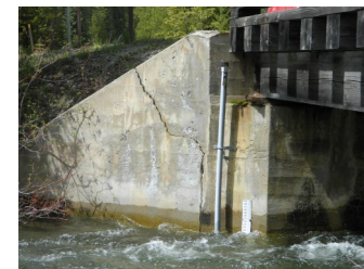
(Left) Bridge abutment