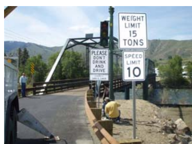
New signal system