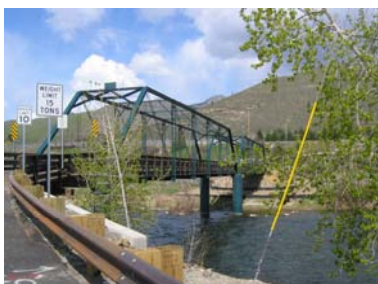
West Monitor Bridge