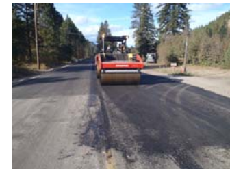
(Left) Mainline Paving on Chumstick Highway