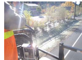
(Left) Hydro-seeding post construction on Chumstick Highway