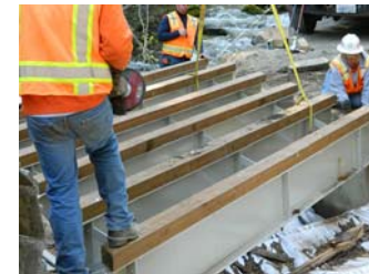
(Left) Installation of replacement bridge at First Creek