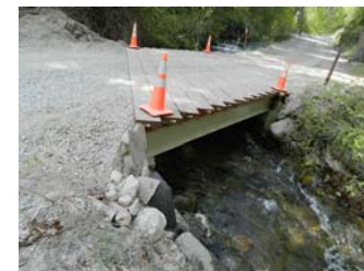
(Left) First Creek Bridge