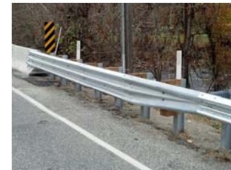
(Left) Newly installed guard-rail on Entiat River Road