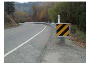
(Left) Newly installed guard-rail on Entiat River Road.