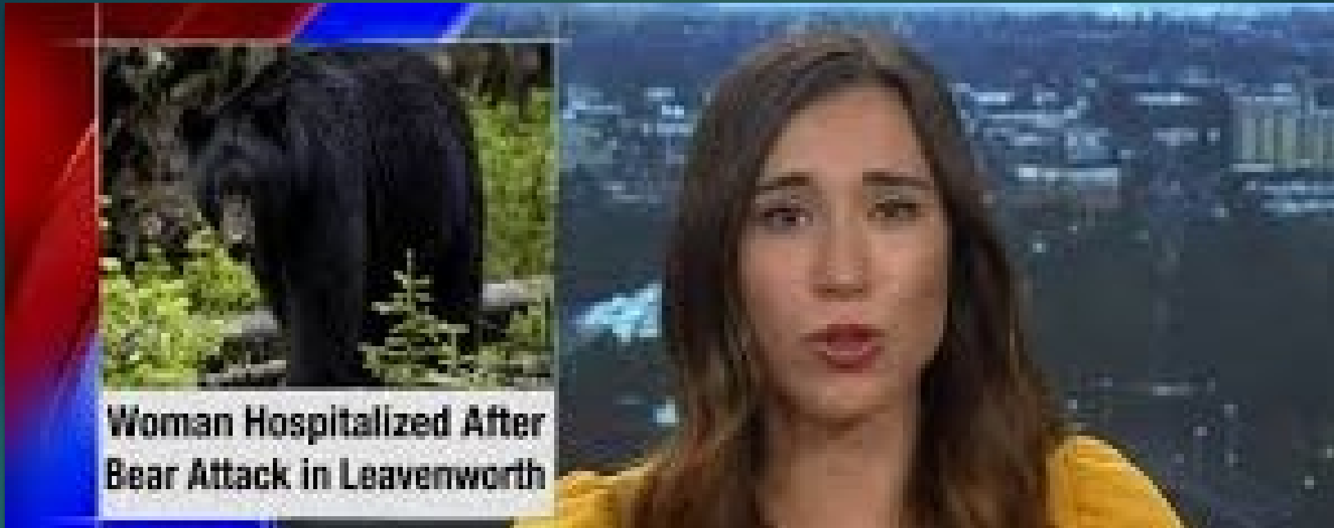
Woman Hospitalized After Bear Attack in Leavenworth

2022 was a bad year for bears in Washington