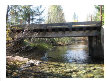
(Left) Chikamin Bridge #807