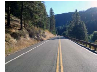
(Left) Rehabilitated Eagle Creek Road