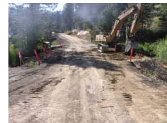
(Left) Bjork Creek Work During Construction